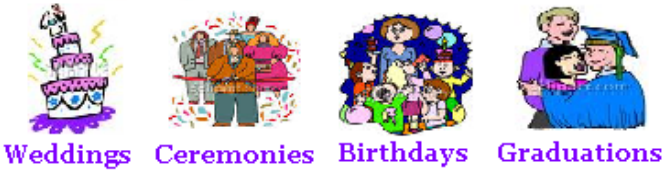
Weddings Ceremonies Birthdays Graduations